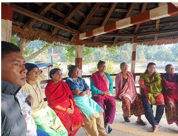
Figure 3: Survey with People's Park Samuha

The first site visited was People's Park Samuha, located within Amritdhara Community Forest in Chitwan district. This group has been managing a five-hectare area allocated to them by the Community Forest. The patch land has been developed into a park where people visit for recreation and picnic purposes. The group has created ponds, maintained walking spaces, and kept the area clean and organized. They have also planted various fruit trees in open