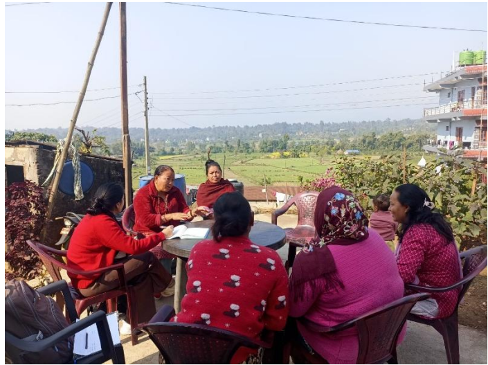
Figure 1: Conducting baseline survey with CFUGs

Nepal has 23,026 community forest representing the dominant forest regime. In Bagmati Province, Nepal, the Forest Act 2019 allows community forest groups to allocate forest land patches to women's committees for livelihoods and small businesses. However, this is rarely implemented due to low awareness and poor tracking. Women must comprise over 50% of these groups per guidelines, yet they mostly hold minor roles without real