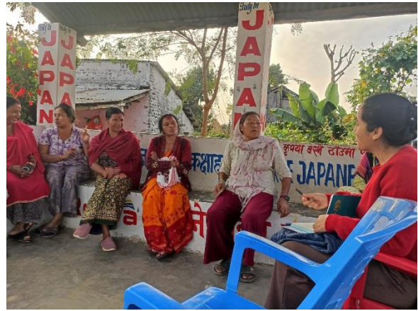
Figure 4: Survey with Amritdhara CF managed by Aayearjan Samuha

The second site also belonged to Amritdhara Community Forest and was managed by Aayearjan Samuha. This group has likewise received five hectares of land and has been actively planting fruit-bearing species such as lemon, mango, litchi, and jackfruit for the past few years. However, their major challenge has been the spread of invasive plant species, which have covered the plantation area and killed many young seedlings and saplings. The group has